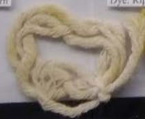
2017-01-04 Cotton Mordant: Alum Dye: Ripe buckthorn