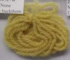
2017-01-04 A+W Mordant: Alum Dye: Ripe buckthorn