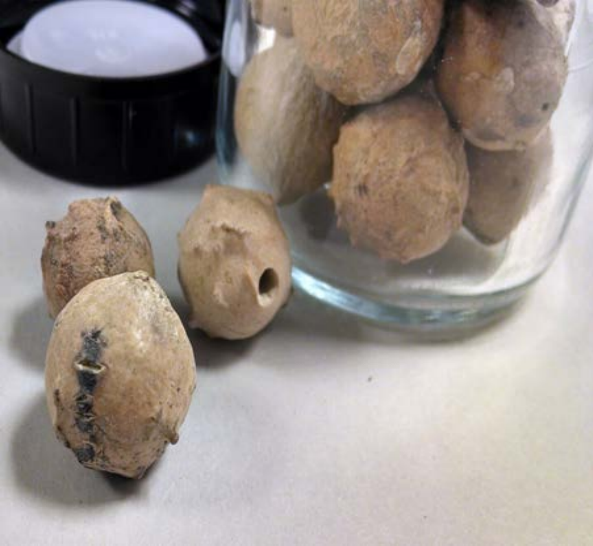
Gall nuts (oak galls)