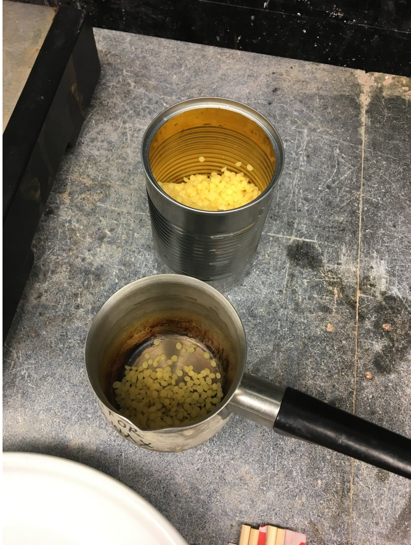
Containers for melting wax