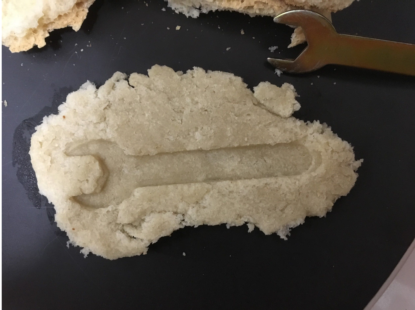
making molds from the “pith” of the bread