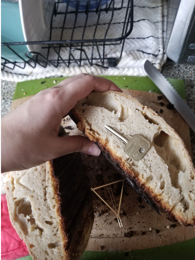
Making molds in bread