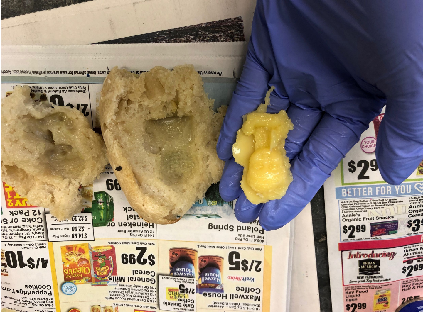
cast from two-piece mold